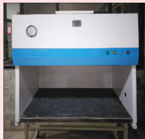
Laminar Flow Hood (Technocratic Services, Pakistan)