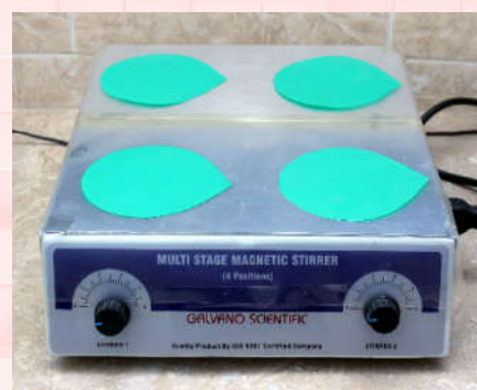
Multistage Magnetic Stirrer with Hotplate (Galvano Scientific, Pakistan)