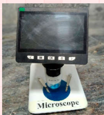
Microscope (Shenzhen Inskam Technology Co. Ltd., China)