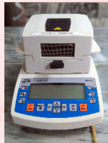
Moisture Analyzer (Radwag, Poland)