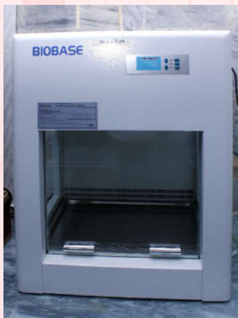
Laminar Flow Hood (Biobase, China)