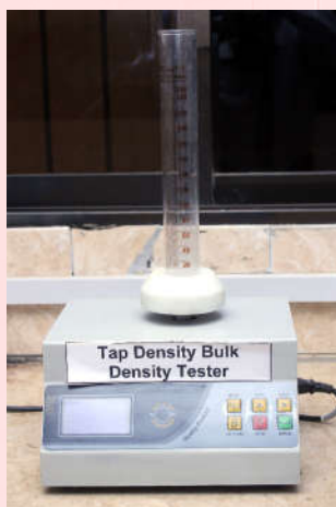
Tap Density Tester (Galvano Scientific, Pakistan)