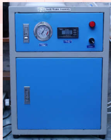
Double RO + Deionizer (PCSIR, Pakistan)